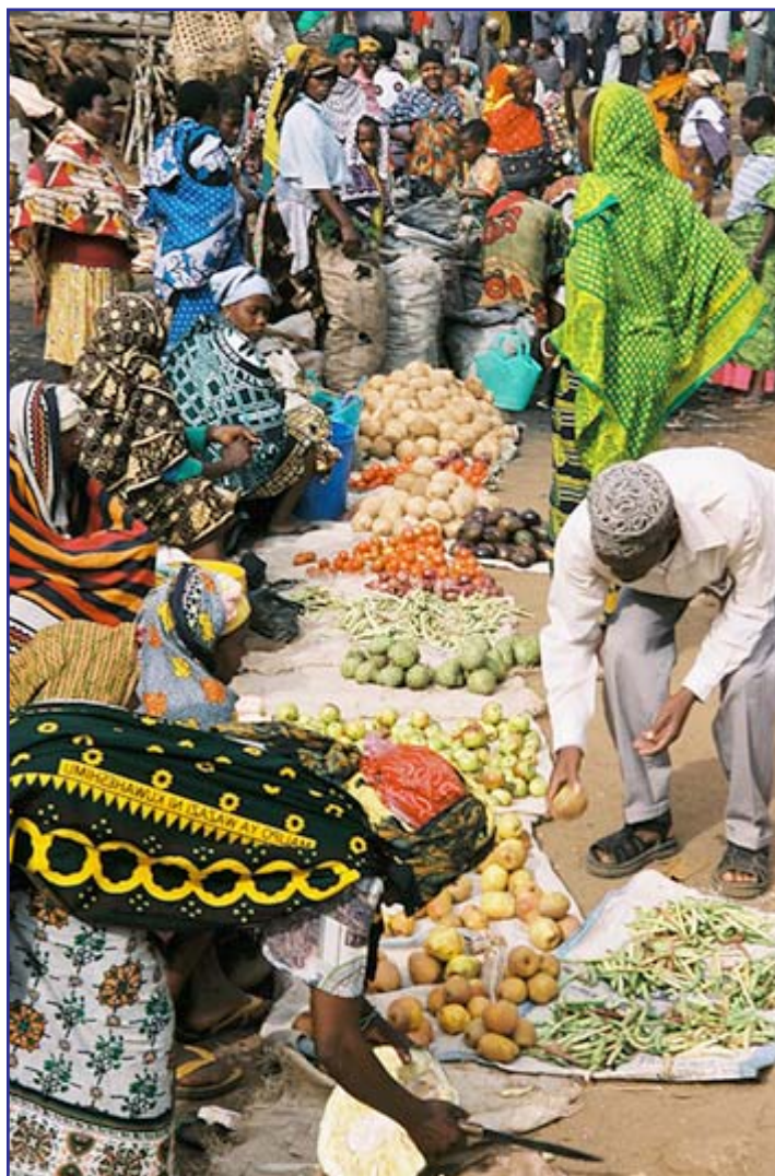
Bottom: The fruit and vegetable markets in Tanzania