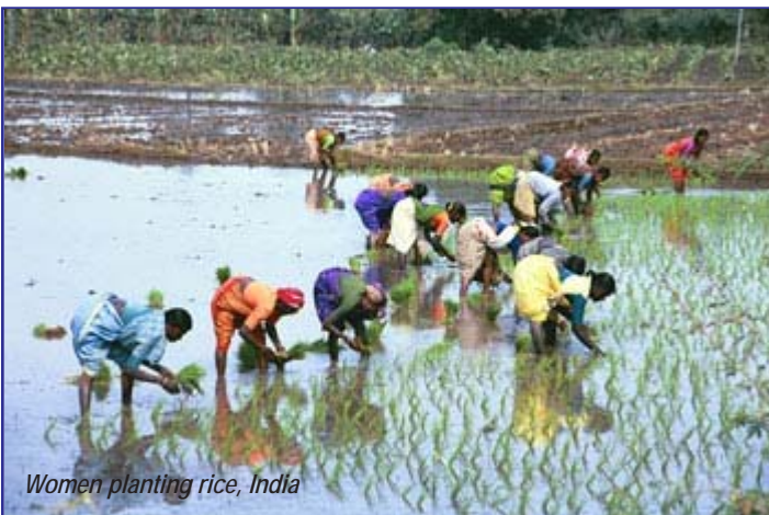
Women planting rice, India