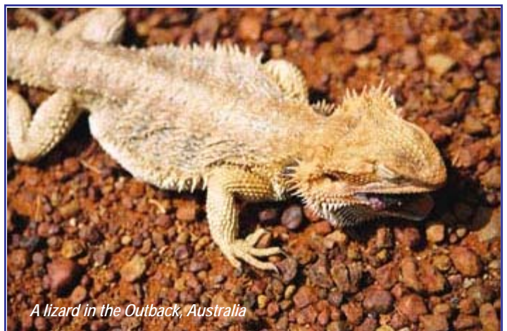
A lizard in the Outback, Australia