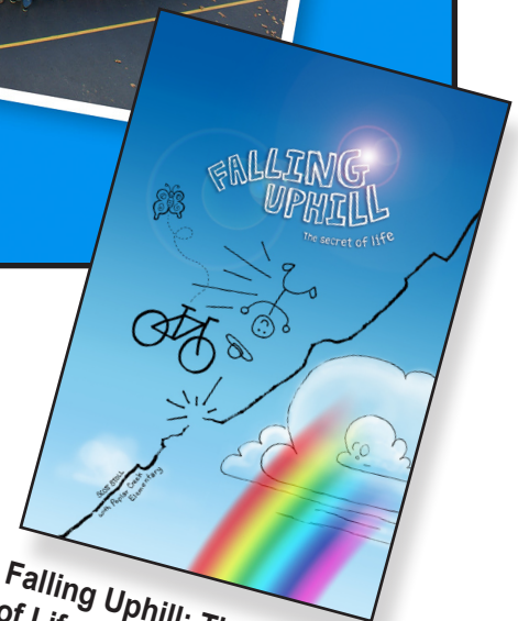
Falling Uphill: The Secret of Life. Illustrated by Poplar Creek Elementary School.